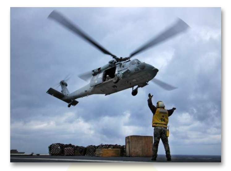
The MH-60S Knight Hawk started as the U.S. Navy's new Vertical Replenishment helicopter..

2001, and MH-60R plans shifted from remanufacturing to new-build production. The Romeo with advanced dipping sonar, sonobuoys, radar, ESM, and electro-optics ultimately assumed the roles of both the SH-60B and SH-60F. It shares an integrated Common Cockpit with the Sierra Seahawk and has powerful processors for autonomous operations. Helicopter Maritime Strike squadron HSM-71 deployed with the MH-60R for the first time in 2009. Like the Sierra, the Romeo can be armed with Hellfire missiles, laser- guided rockets, and guns for surface strike missions.