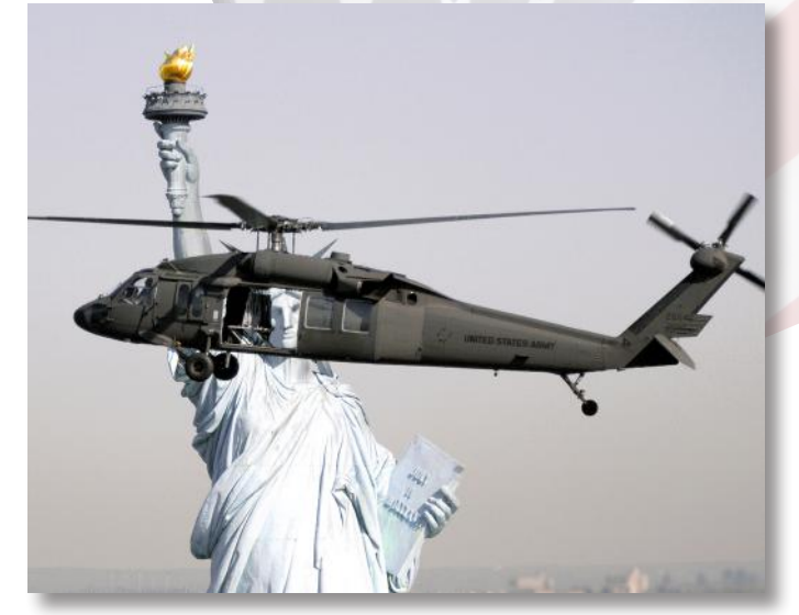
After 40 years, the Black Hawk helicopter remains a powerful warfighter and lifesaver.

The Utility Tactical Transport Aircraft System (UT-TAS) specified by the Army Materiel Command in 1971 spawned Special Operations, Medical Evacuation and electronic warfare helicopters for the Army; sub hunters and fleet support helicopters for the Navy; rescue helicopters for the Air Force and Coast Guard; and Presidential transports for the Marine Corps. Worldwide, the