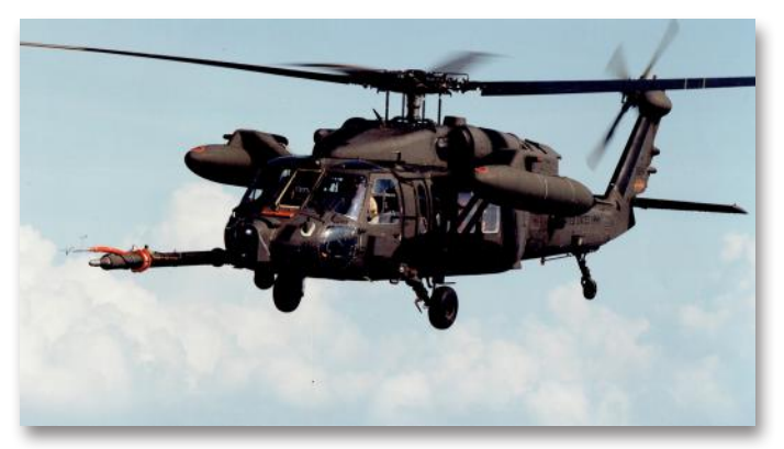
The MH-60K Special Operations Aircraft joined the 160th Special Operations Aviation Regiment in 1995 (Sikorsky)

The Army National Guard took delivery of the 2,500th Black Hawk – a UH-60L – in 2002. However, Operations Enduring Freedom in Afghanistan in 2001 and Iraqi Freedom in Iraq in 2003 underscored the limits of Black Hawk performance at high density altitudes, and need for integrated cockpits to manage crew workload. The UH-60M updated the crashworthy, ballisticallytolerant Black Hawk with a high-lift all-composite main rotor, a digital automatic flight control system, more powerful and durable -701D engines, and an integrated cockpit with digital connec-