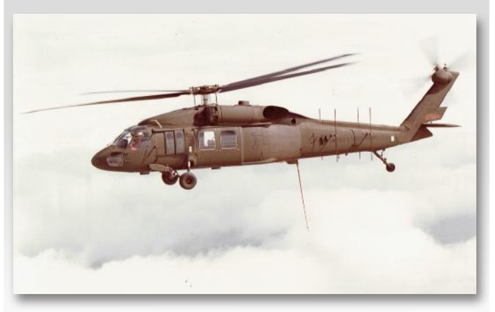
EH-60A Quick Fix Special Electronic Mission Aircraft could intercept enemy communications. (Sikorsky)

The Army had more than 1,000 Black Hawks by 1990 when UH-60s were rushed to Operation Desert Shield in Southwest Asia. In the fast-moving Desert Storm of 1991, Black Hawks hauled troops, equipment, and supplies throughout the combat theater. EH-60A Quick Fix Special Electronic Mission Aircraft flew in Desert Shield and Desert Storm to intercept, jam, and locate Iraqi communications.