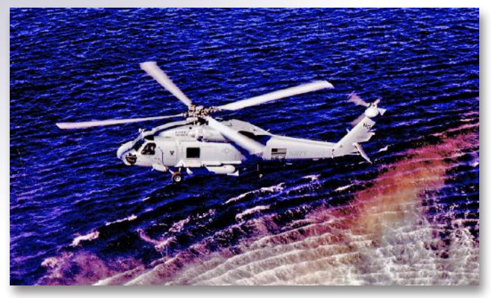
The S-70B-4 or SH-60F CV Helo was the carrier-based ASW helicopter of the U.S. Navy.

The U.S. Navy chose a different Sikorsky Seahawk to replace the sonar-dipping S-61 (SH-3) Sea King in the noisy inner zone around aircraft carriers. The S-70B-4 (SH-60F) CV Helo first flew at the Stratford plant in March 1987 and entered service with squadron HS-10 at North Island in June 1989. HS-2 on the Atlantic Coast made the first operational deployment in 1990. The SH-60F replaced the last active duty ASW Sea King by 1993. CV Helo deliveries concluded with the 82nd helicopter in December 1994. The SH-60F served the U.S. Navy until 2016, and it started a line of international Naval Hawks.