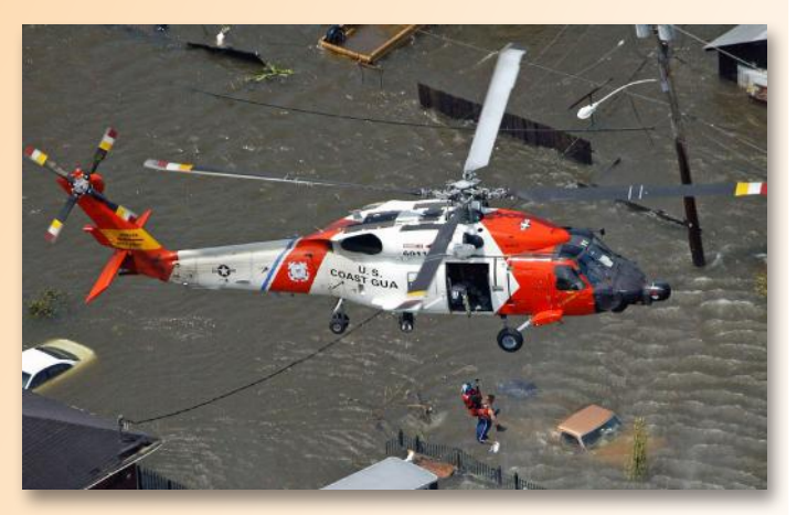
The Coast Guard HH-60J Jayhawk has been updated to the digital MH-60T.

Sikorsky delivered the last of 42 HH-60Js to the Coast Guard in 1996. Jayhawks acquired night visionics, health-and-usage monitoring systems, and other improvements in service. Aging airframes, obsolescent avionics, and a new Airborne Use of Force (AUF) mission after 9/11 led the Coast Guard Aviation Logistics Center (ALC) at Elizabeth City, North Carolina, to rebuild the HH-60J fleet to MH-60T standards with "glass" cockpits built around the Common Avionics Architecture System.