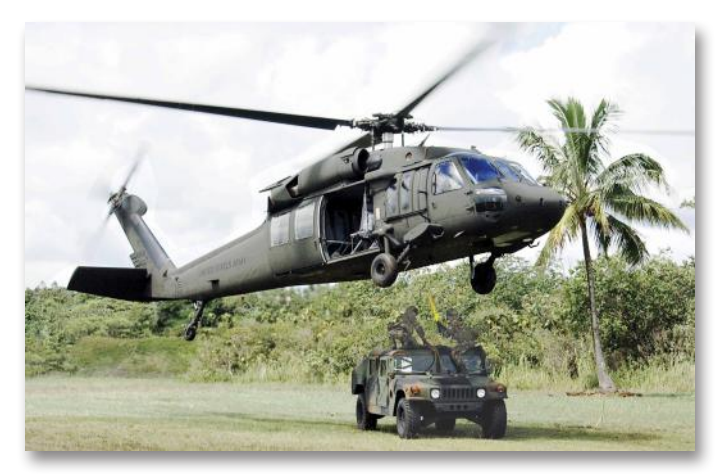
The UH-60L entered production in 1989.

The Army had more than 1,000 Black Hawks by 1990 when UH-60s were rushed to Operation Desert Shield in Southwest Asia. In the fast-moving Desert Storm of 1991, Black Hawks hauled troops, equipment, and supplies throughout the combat theater. EH-60A Quick Fix Special Electronic Mission Aircraft flew in Desert Shield and Desert Storm to intercept, jam, and locate Iraqi communications.