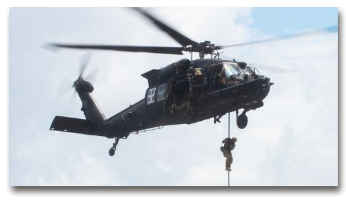
The MH-60M Special Operations Black Hawk was fielded in 2011.

Foreign Military Sales and Direct Commercial Sales have delivered S-70M/UH-60M Black Hawks to International operators Simultaneous with Stratford production, the S-70i Black Hawk is made by Sikorsky Mielec in Poland for the global market.