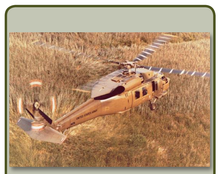
The UH-60A achieved Initial Operational Capability with the U.S. Army in 1979.

Special Operations Black Hawks evolved with early digital cockpits in the MH-60L and an integrated avionics system in the MH-60K. The airrefuelable MH-60K Special Operations Aircraft for long-range night/adverse weather missions rolled out 13 March, 1990. It was declared Mission Ready in October 1995 and would serve worldwide until replaced by the MH-60M in 2015.