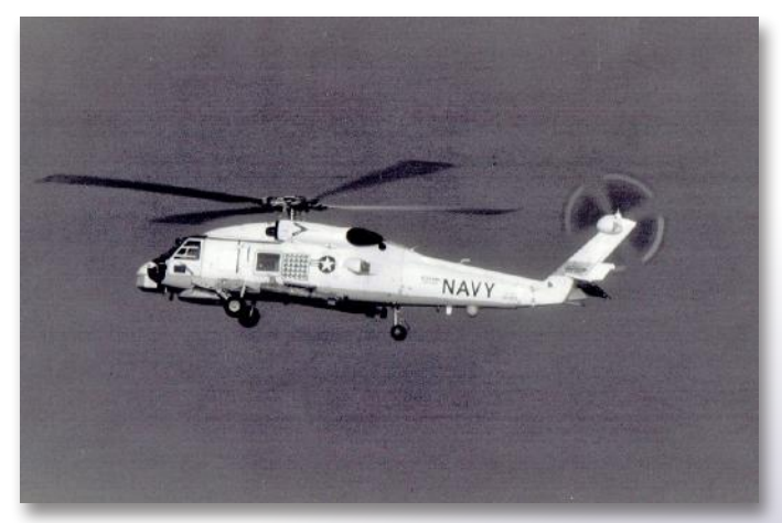
The SH-60B Seahawk gave the Navy its Light Airborne Multipurpose System.