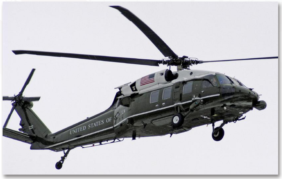
The Presidential VH-60N remains in service with Marine squadron HMX-1.

The capabilities and missions of Sikorsky's S-70 Black Hawk continue to evolve. International S-70Ms and S-70is are now available with integrated armament. U.S. Navy MH-60Rs are operational with Automatic Radar Periscope Detection and Discrimination. The U.S. Army continues development of technologies to see and fly in Degraded Visual Environments. In its latest iterations, America's Black Hawk is more ready than ever to fight wars and save lives.