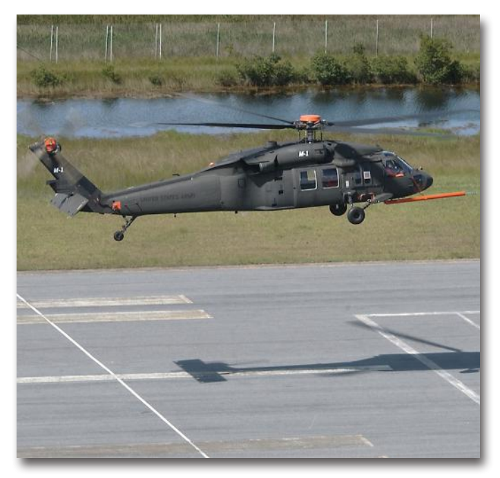
The first UH-60M was a conversion of an analog Black Hawk. (Sikorsky)

The Army National Guard took delivery of the 2,500th Black Hawk – a UH-60L – in 2002. However, Operations Enduring Freedom in Afghanistan in 2001 and Iraqi Freedom in Iraq in 2003 underscored the limits of Black Hawk performance at high density altitudes, and need for integrated cockpits to manage crew workload. The UH-60M updated the crashworthy, ballisticallytolerant Black Hawk with a high-lift all-composite main rotor, a digital automatic flight control system, more powerful and durable -701D engines, and an integrated cockpit with digital connec-