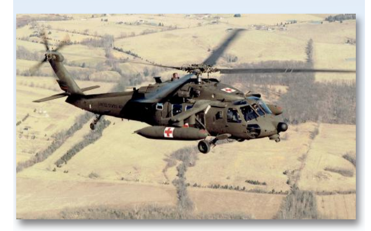
The YUH-60A(Q)1 evolved into today's HH-60L/M Dust-Off Helicopters.

In war and non-combat contingency operations, the Black Hawk performed with equal valor. Black Hawks were part of the relief forces in Operation Provide Comfort after Desert Storm, and they went on to support relief and peacekeeping operations in Somalia during Operation Restore Hope in 1992 and 1993. Fifty Army Black Hawks were part of the initial peacekeeping contingent for Operation Joint Endeavor in Bosnia in 1995. When Operation Uphold Democracy pressured Haiti's dictator to step down in 1995, 33 Black Hawks of the 82nd Aviation Brigade self-deployed 400 miles over water in preparation for the invasion. Fifty more UH-60s flew from the carrier USS Eisenhower to deploy the spearhead of the 10th Mountain Division.