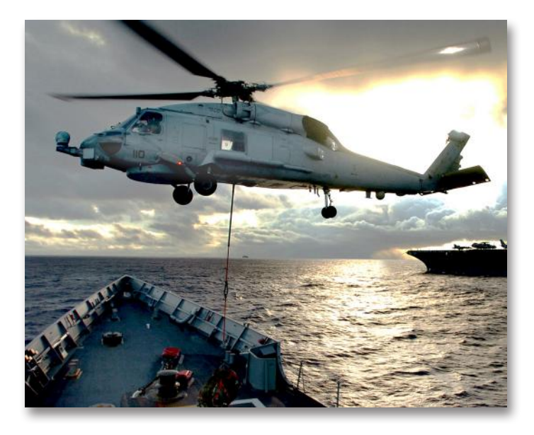
The MH-60R Multi-Mission Naval Helicopter replaced the SH-60B and SH-60F in the U.S. Navy

The U.S. Navy took delivery of its 251st and final MH-60R in 2018 and expects Romeo and Sierra Seahawks in service to 2040. International Naval Hawks remain in production at Stratford.