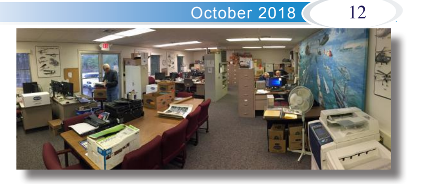
The Archives has been temporarily consolidated into the old Reception Center, awaiting the renovation of the Barrett House