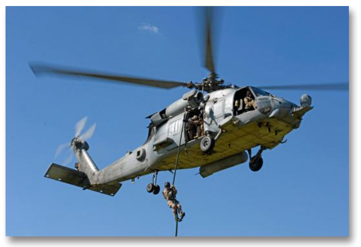
The U.S. Navy HH-60H was equipped for Strike Rescue and Special Warfare Support.

U.S. Navy air wings today mix MH-60S Seahawks for strike rescue and utility missions with multisensor MH-60Rs for ASW and ASuW. The first Romeo Seahawk, a re-built SH-60B, flew in July