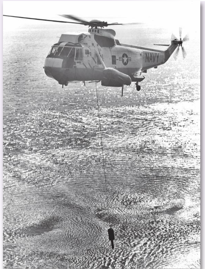
The SH-3H hunted with sonar, MAD, radar, and Electronic Support Measures.

The SH-3D introduced better dipping sonar, but the U.S. Navy Sea Control Ship concept in the early 1970s drove development of the multi-sensor SH-3H with sonar, Magnetic Anomaly Detector, sonobuoys, and search radar. The U.S. Navy converted 151 Sea Kings to SH-3Hs from 1972 to 1982, then recycled SH-3Hs through a Service Life Extension Program (SLEP) at Stratford beginning in 1986. Sea Kings remained in U.S. Navy service until 2009.