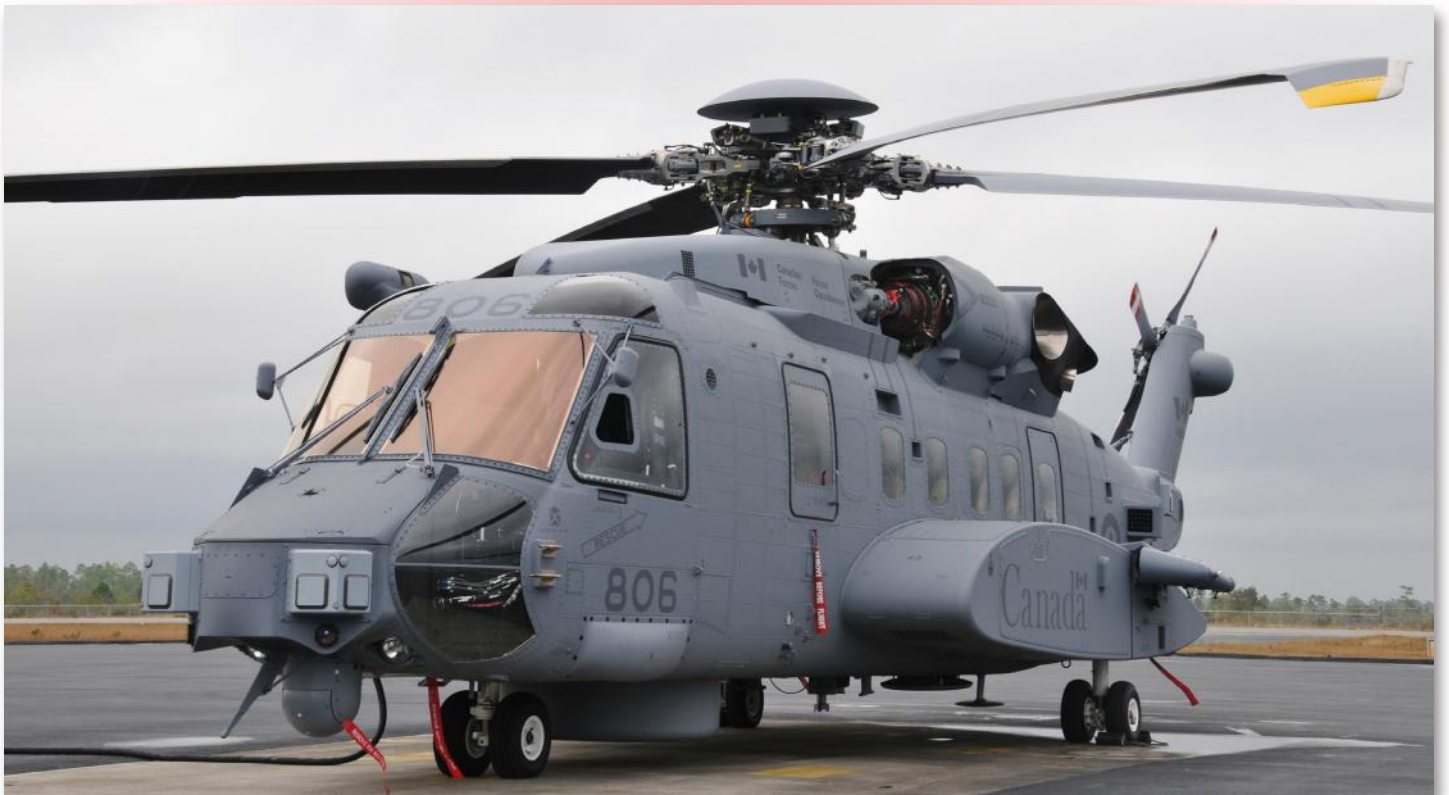
Canada now operates the CH-148 Cyclone, the marinized, militarized, fly-by-wire Sikorsky S-92.