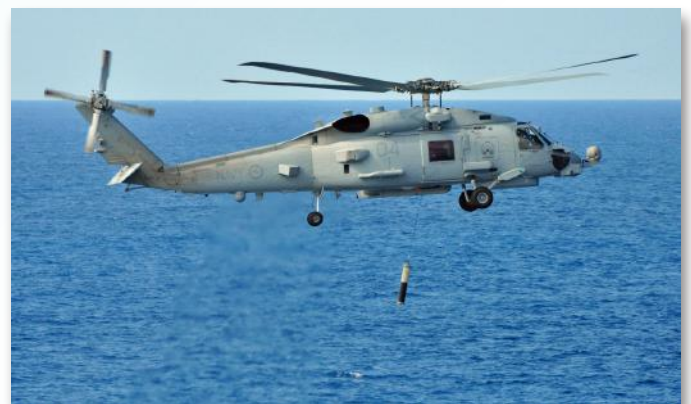
Australia was the first international customer for the MH-60R.