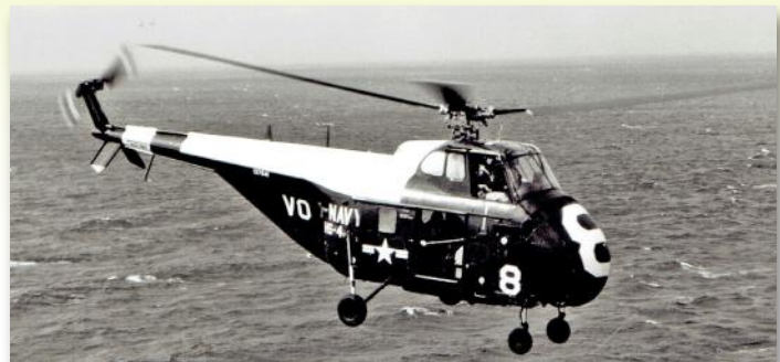
The S-55 (HO4S-3) could carry either dipping sonar or a torpedo and had to work in hunter-killer teams.

The U.S. Navy commissioned its first antisubmarine warfare helicopter squadron, HS-1, at Naval Air Station Key West, Florida on October 3, 1951, and other navies followed. The UK Royal Navy formed 706 Squadron for ASW with Sikorsky-built S-55s in 1953, and Westland Helicopters began license production of the Whirlwind in the UK soon after. Canada formed Helicopter Anti-Submarine Squadron Fifty with S-55s in 1955.