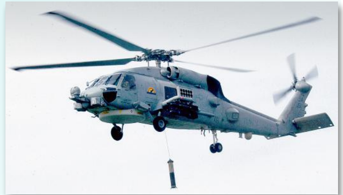
The MH-60R Sea Hawk is the U.S. Navy multi-mission helicopter with sonar, sonobuoys, search radar, electro-optics, and ESM.

from carriers and small decks ultimately replaced the SH-60B, SH-60F, and fixed-wing ASW aircraft.