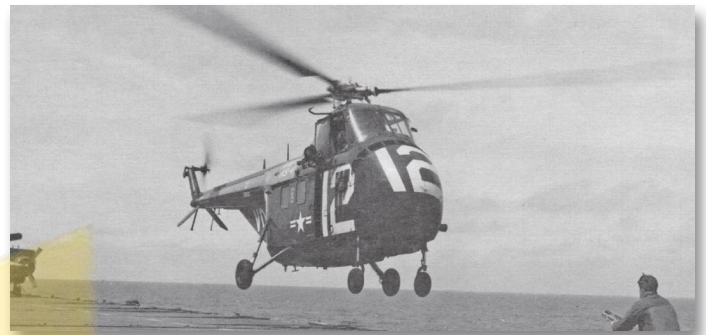
The S-55 (HO4S-3) gave the U.S. Navy its first operational ASW helicopter deployed on aircraft carriers.

In April 1950, the Navy ordered utility S-55s (HO4S-1s with folding three-bladed main rotors and 550 hp Pratt & Whitney engines). When the tandem-rotor Bell Model 61 struggled with technical problems, the Navy chose the Sikorsky S-55 as its substitute sub hunter. Navy HO4S-3s had 700 hp Wright piston engines and could operate in ASW teams, the submarine "hunter" with dipping sonar and "killer" with a torpedo.