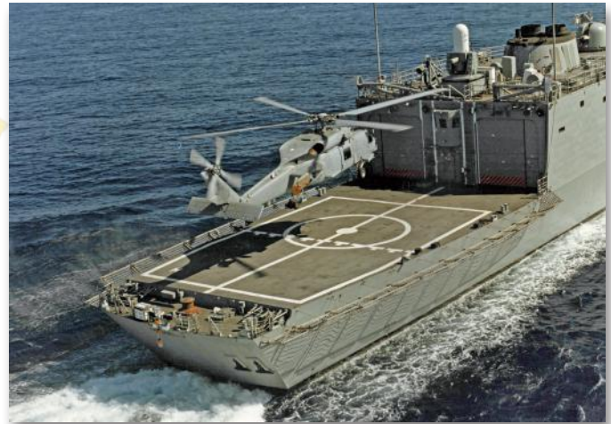
The S-70B-1 or SH-60B was the airborne portion of the Light Airborne Multipurpose System Mk. III (LAMPS III) and fed sensor data to the ship for processing. (Sikorsky Archives)

The S-70C(M) Thunderhawk delivered to the Republic of China in 1991 evolved from the U.S. Navy S-70B-4/SH-60F CV Helo. (Sikorsky Archives)