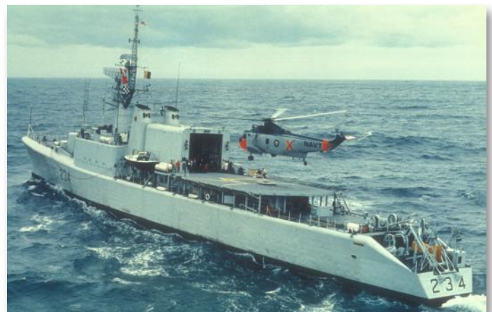
Canada was the first international Sea King customer and went on to operate its CH-124s from frigate decks for 50 years.