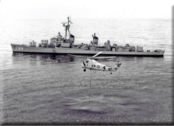
The S-58 (HSS-1) was designed for ASW. Here, a Seabat from HS-4 hovers with dipping sonar near the destroyer USS Richard B. Anderson in 1958.

The 7,900 lb S-55 was short of range and payload for ASW. The April 21, 1954 Sikorsky News showed tie-down tests of the new S-58 (Navy XHSS-1), and the photo caption stated simply, "Specifications are classified." However, with a 1,525 hp engine and four-bladed rotor, the 14,000 lb S-58 (Navy HSS-1 or SH-34G) Seabat promised to be a more effective hunter or killer, one even compatible with a nuclear depth charge. In September 1955, Sikorsky News reported on the successful HSS-1 test effort. Navy Squadron HS-3 was the first to receive the HSS-1 in 1955.