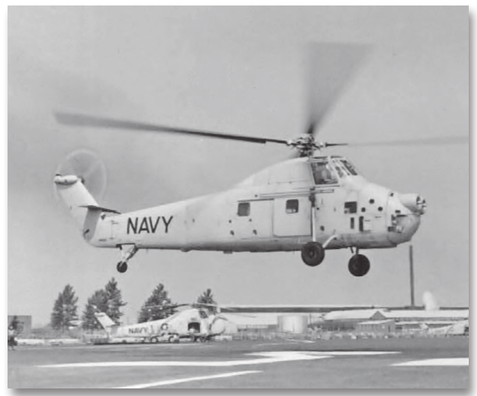
The HSS-1F testbed flew with twin GE T58 turboshafts in 1957.

Navy Squadron HS-5 at Quonset Point, Rhode Island received HSS-1Ns in 1960 and, after dangerous testing, the Nightdippers made autohover routine. The Sikorsky News reported delivery of the 1,000th S-58 in November 1958, an ASW helicopter made in Bridgeport for the U.S. Navy. More S-58 sub-hunters were produced under license by Westland in the UK, Fiat in Italy, and Sud Aviation in France. The March 1958 Sikorsky News reported, "Two S-58 helicopters have been purchased by the Japanese Navy for anti-submarine warfare use. . . [The S-58] has a payload capacity more than double the S-55 currently in use by the Japanese."