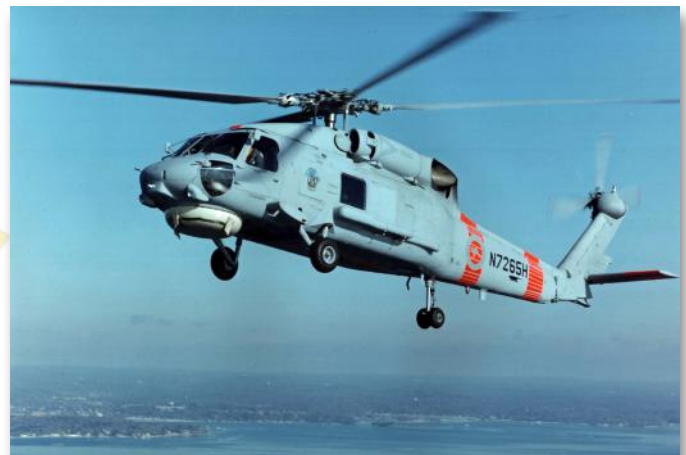
The S-70B-2 Seahawk was the Roll Adaptive Weapons System developed for the Royal Australian Navy.