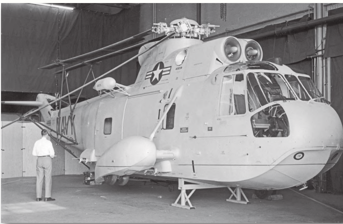
The S-61 mockup constructed at Bridgeport showed the distinctive Sea King boat hull.

The first of seven YHSS-2 prototypes flew on March 11, 1959 with company test pilots Robert Decker and Francis 'Yip' Yirell. The new sub hunter soon broke records. On 17 May, 1961 a Sea King clocked 192.7 mph over a 3 km course, and on 1 December, another set three world helicopter speed records: 182.8 mph over a 100 km course, 179.5 mph over 500 km, and 175.3 mph over 1,000 km. An SH-3A reached 210.65 mph on a 20 km course in February 1962, and another, The Dawdling Dromedary, set a non-stop helicopter distance record flying 2,105.49 miles from the USS Hornet off San Diego to the USS Franklin D. Roosevelt off Jacksonville on March 6, 1965.