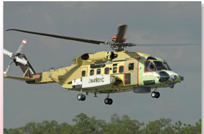
The first CH-148 Cyclone Canadian Maritime Helicopter flew on November 14, 2008 at West Palm Beach.