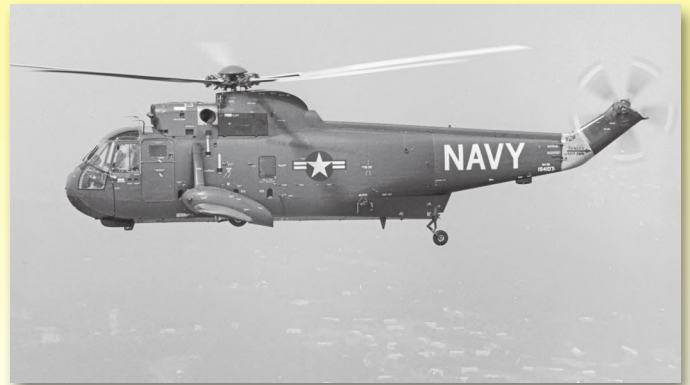
The second S-61 variant in the US Navy (SH-3D) was the pattern for export Sea Kings.

also promises greater range, larger payload and better visibility than its predecessor, the HSS-1. First flight of the advanced helicopter is scheduled for 1959. Company designation of the new ship is S-61." A Navy contract was awarded on December 24, 1957, and what should have been the HS2S in service became the HSS-2 (later SH-3A) Sea King.