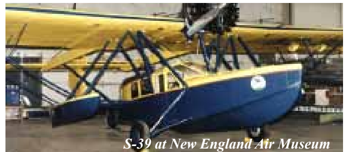
S-39 at New England Air Museum