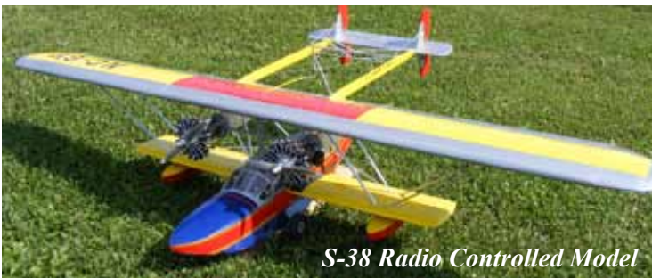
S-38 Radio Controlled Model

Museums Such As The New England Air Museum Display Amphibians Around The Country.