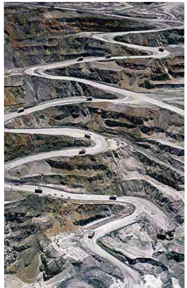
Road from mining site to rock processing plant