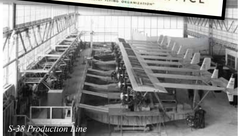
S-38 Production Line