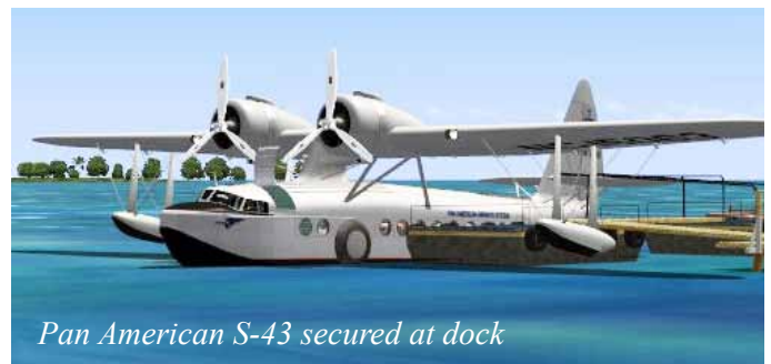
Pan American S-43 secured at dock