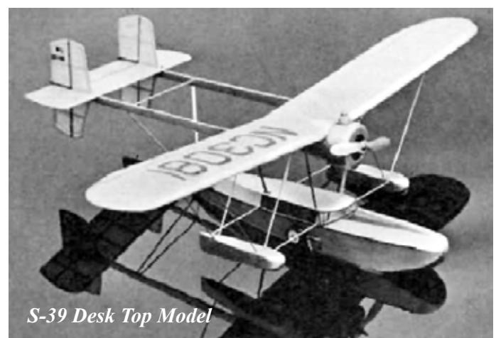
S-39 Desk Top Model