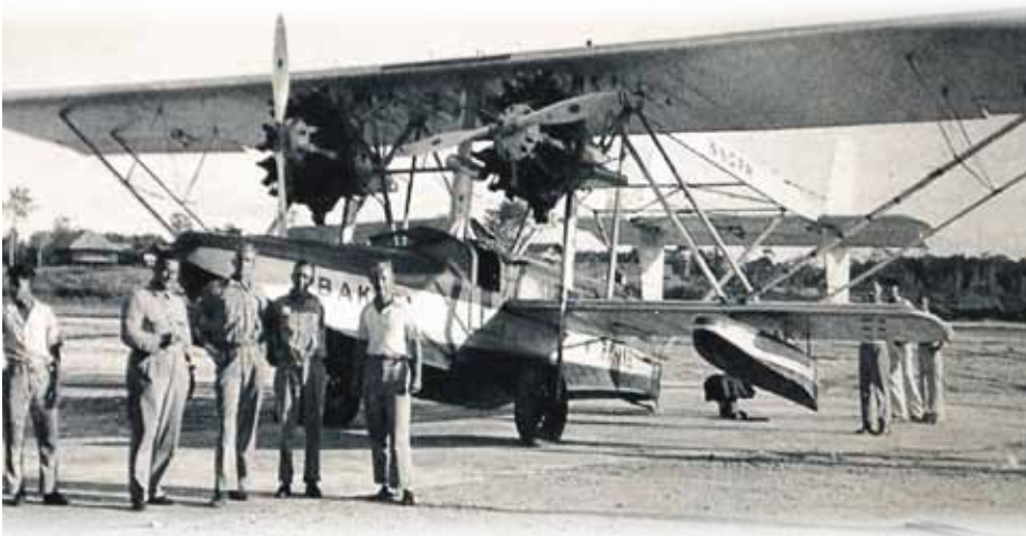
S-38 with pilots and crew that supported air drops of supplies to expedition