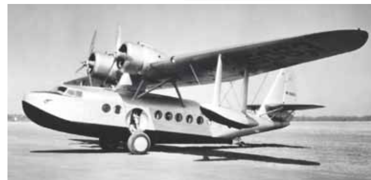
Military version of the S-43. One survived the attack at Pearl Harbor and is stored at the National Air and Space Museum in Washington, D.C. awaiting restoration.