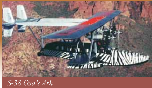
S-38 Osa's Ark