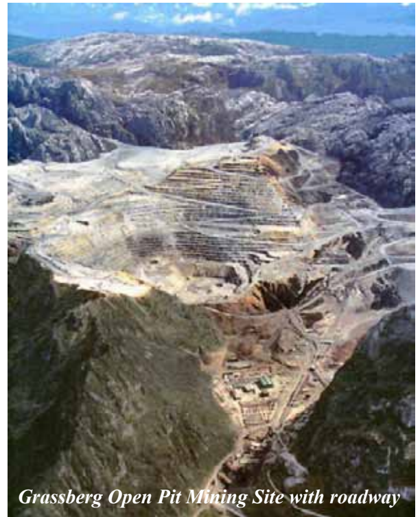
Grassberg Open Pit Mining Site with roadway

Freeport Indonesia started mining Ertsberg in 1973 and an adjacent mountain peak named Grassberg in 1996, because the mountain peak was flat and covered with grass resembling an Alpine meadow. It is the largest gold mine, and third largest copper mine in the world. The process starts with mining large boulders which are crushed, and converted to slurry and finally transported to oar ships by pipelines. The 2006 production was 611,000 tons of copper, 58,500 grams of gold, and 174,500 grams of silver. 🇮🇩