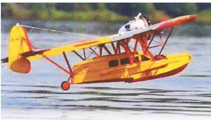
S-39 Radio Controlled Model