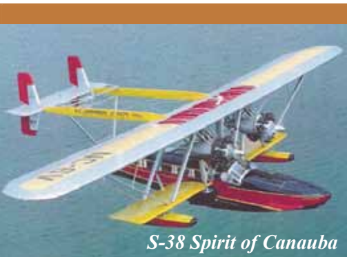
S-38 Spirit of Carnauba

Born Again Restoration built a second S-38 in the jungle Zebra color scheme. The original S-38 with a similar color scheme was used by Osa and Martin Johnson (no affiliation with Johnson Wax Company) during their expeditions to Africa in the 1930s photographing and filming wild life movies for Hollywood. This aircraft was called "Osa's Ark". 🌀