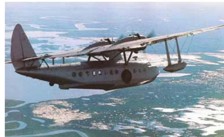
Howard Hughes S-43