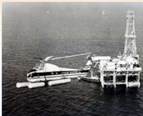
Fixed pontoon design also referred to as "Hot Dog Floats"