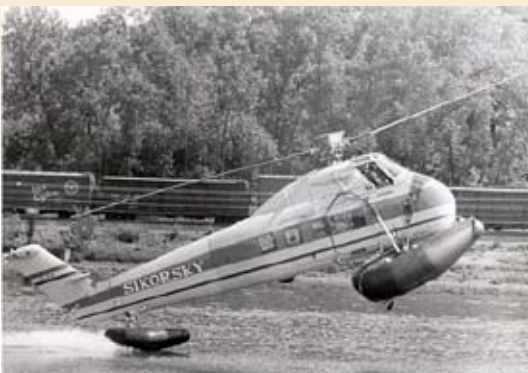
Pop out wheel mounted flotation bags

S-58 flotation development expanded the aircraft's desirability for offshore oil operations.