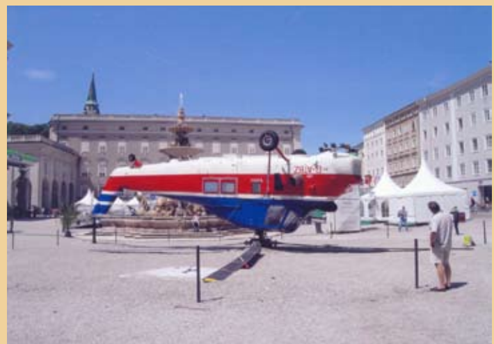
Artistry with a Wessex S-58 in Salzburg, Austria