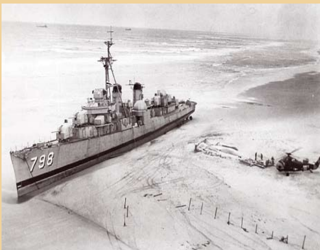
HSS-1 surveys dilemma at Beach Haven, NJ 3-62