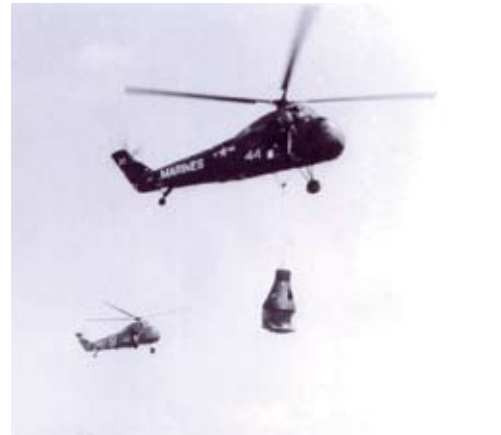
Alan Shepherd is hoisted aboard the Marine HUS-1 aircraft at sea and transported to a naval ship. ☺