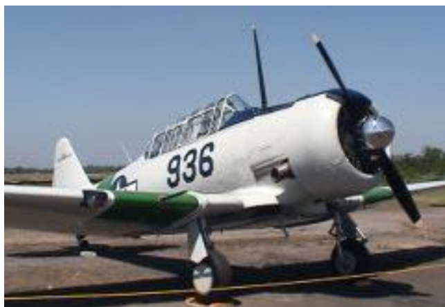
Immaculate examples of a North American T-6 (L), and a Beech 18 (R).