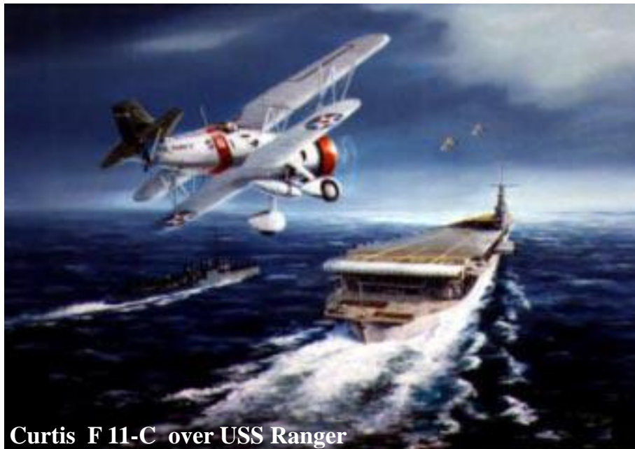
Curtis F 11-C over USS Ranger