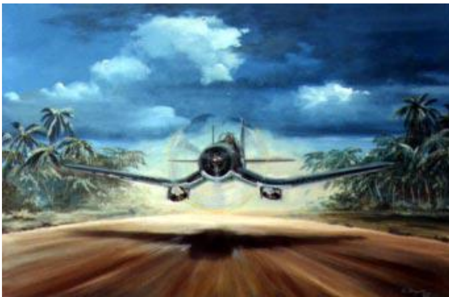
Left: Corsair Low Pass

Society of Illustrators in New York, the Society of Marine Artists and is the past President of the American Society of Aviation Artists. Quote - "Retirement is a very busy part of ones life".