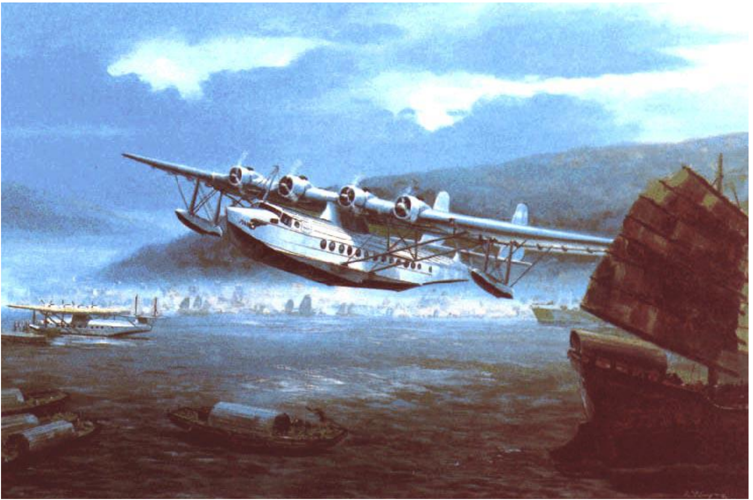
S-42 Hong Kong Clipper Airborne. Painting © 2000 Andy Whyte