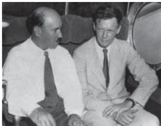
Sikorsky and Lindbergh on a test flight