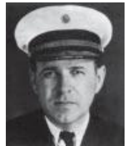
Capt. Ed Musick Chief Pilot