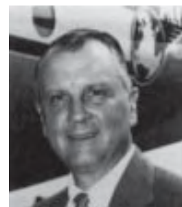
Juan Trippe Pan Am Founder