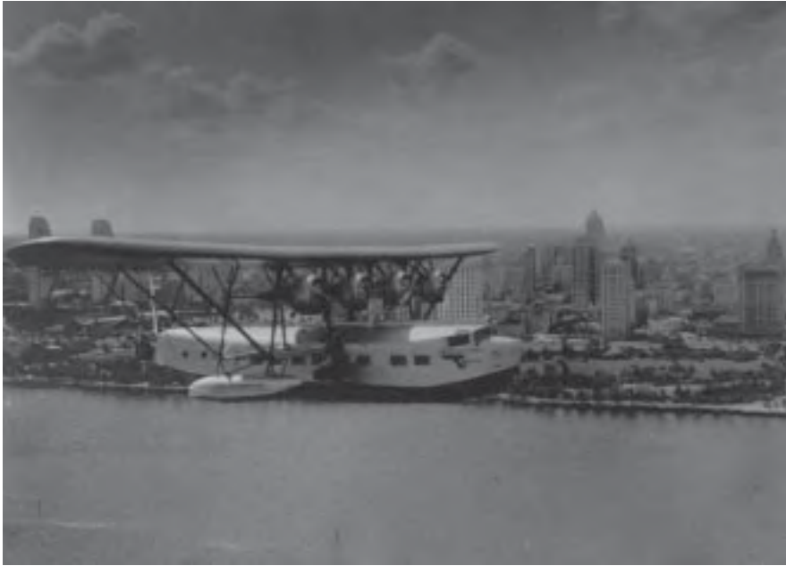
S-40 off Miami

A quantum leap or so it seemed at the time. The S-40 at 17 tons was more than twice the weight of its predecessor the S-38. It was powered by four Pratt & Whitney Hornet engines. Experience with the route pioneering done by Charles Lindbergh and Igor Sikorsky in the Pan Am S-38 contributed to the design. Three were built, and christened "American Clipper", "Caribbean Clipper", and "Southern Clipper". The first, the "American Clipper" was christened by Mrs. Herbert Hoover at a Washington ceremony. The aircraft went on to give exemplary service for many years.