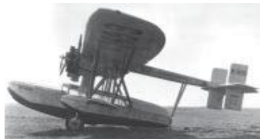
Above: Pan Am S-38 in early paint scheme before the famous logo made its appearance.