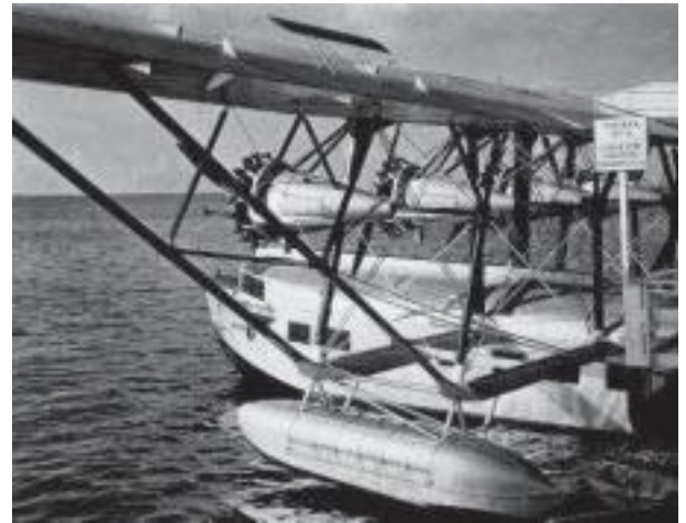
At Havana Cuba