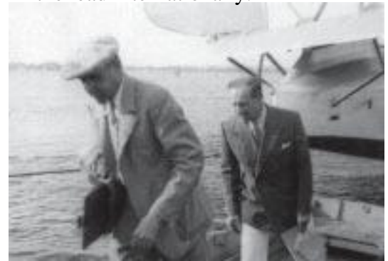
Sikorsky and Sergievsky disembark after a test flight.

New Ideas were needed for better economics and performance, and besides four improved P&W Hornet engines, the S-42 also had wing flaps and the new Hamilton Standard constant speed propellers. On August 1st 1934, coincidentally the very day a letter from the National Aeronautic Association was received inviting Sikorsky to establish records, the S-42 flown by Boris Sergievsky established no less than eight speed and load over distance records, putting the US in the lead internationally.