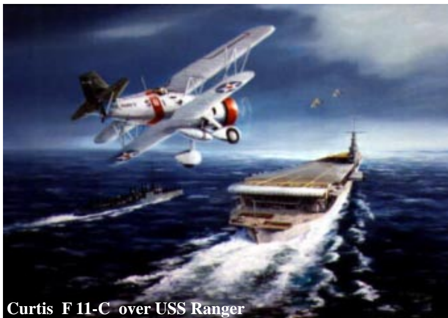
Curtis F 11-C over USS Ranger