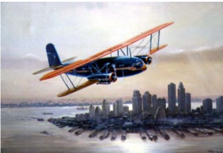
Top Left: Curtis O2-U