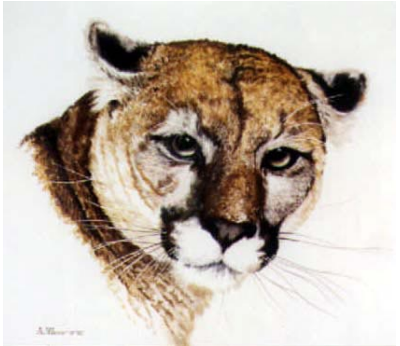
Center Right: Cougar in Bridgeport Zoo