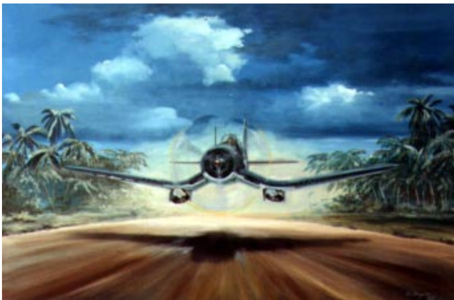
Left: Corsair Low Pass

Society of Illustrators in New York, the Society of Marine Artists and is the past President of the American Society of Aviation Artists. Quote - "Retirement is a very busy part of ones life".