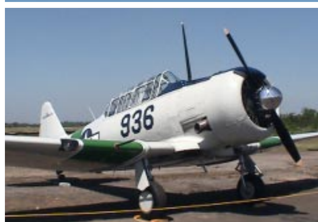
Immaculate examples of a North American T-6 (L), and a Beech 18 (R).